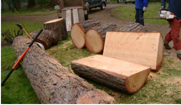
Figure 5. Natural bench under construction