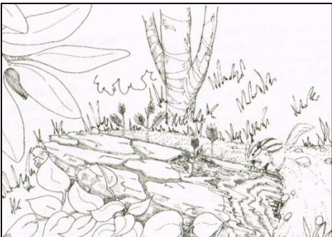
Figure 7. A nurse log can create a biologically-rich wonderland in your backyard 1 .