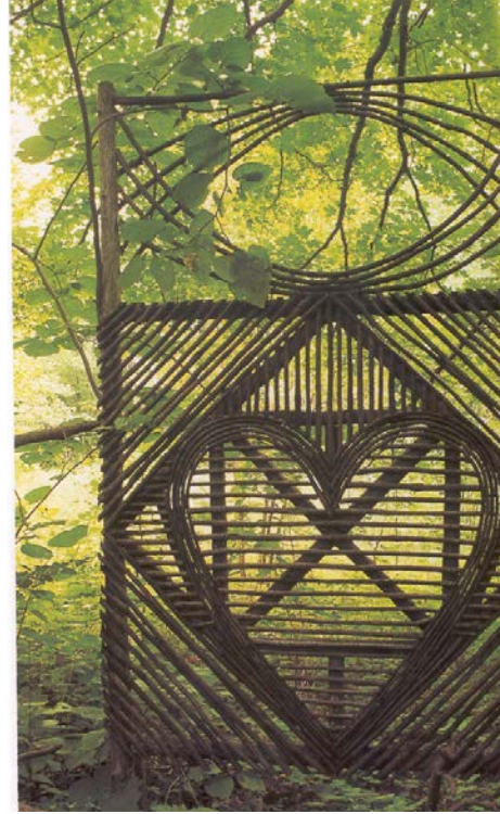
Figure 8. Screen braced in trees appears as a gate in the woods