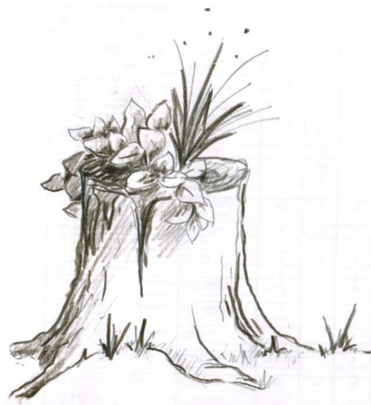
Figure 4. Nurse log stump as planter with native vegetation