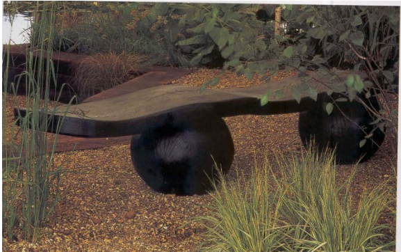
Figure 6. Wood chip ground cover, exotic bench, and wooden retaining wall in background