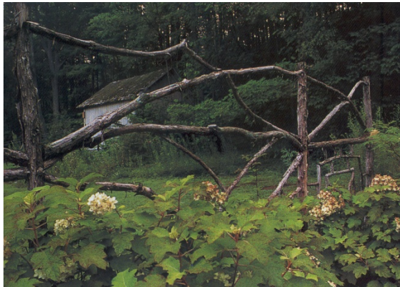
Figure 1. Rustic fence as boundary delineation

Natural wood components in the landscape can add charm and character to any site, at a minimal cost. Options can include slab benches, natural planters, informal fencing, wildlife snags, wooden stairs, nurse logs, a natural trail system made from wood chips... the possibilities are endless.