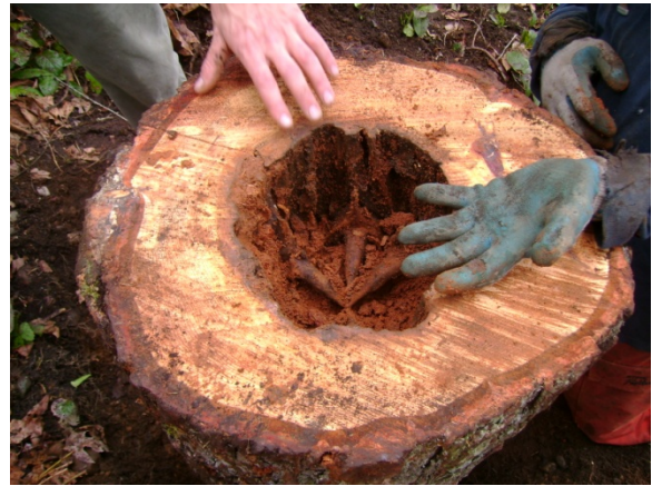
Figure 3. Nurse log stump in preparation to be a planter